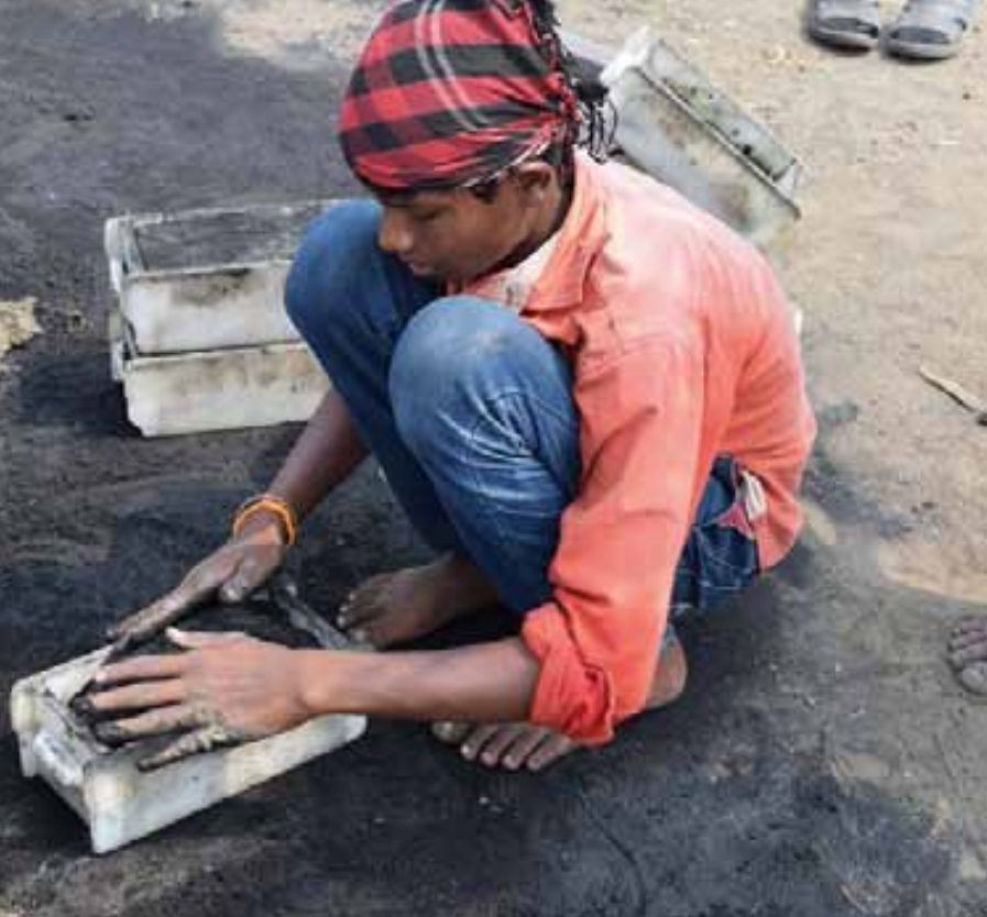
India: migrated young boy working at a brick kiln