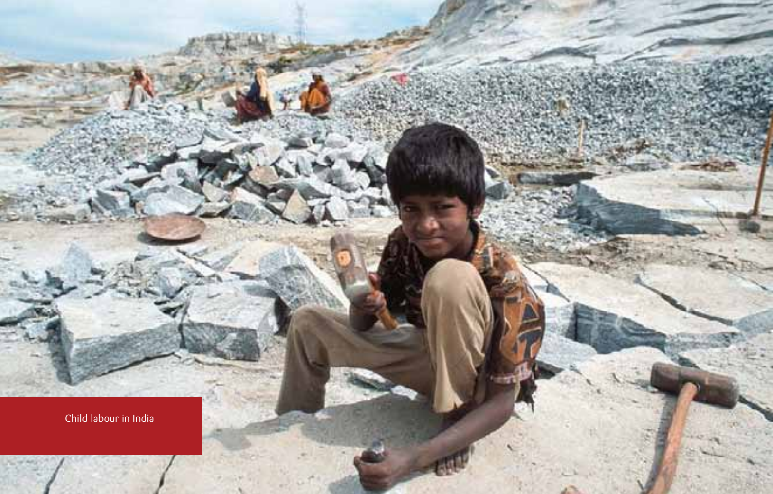
Child labour in India