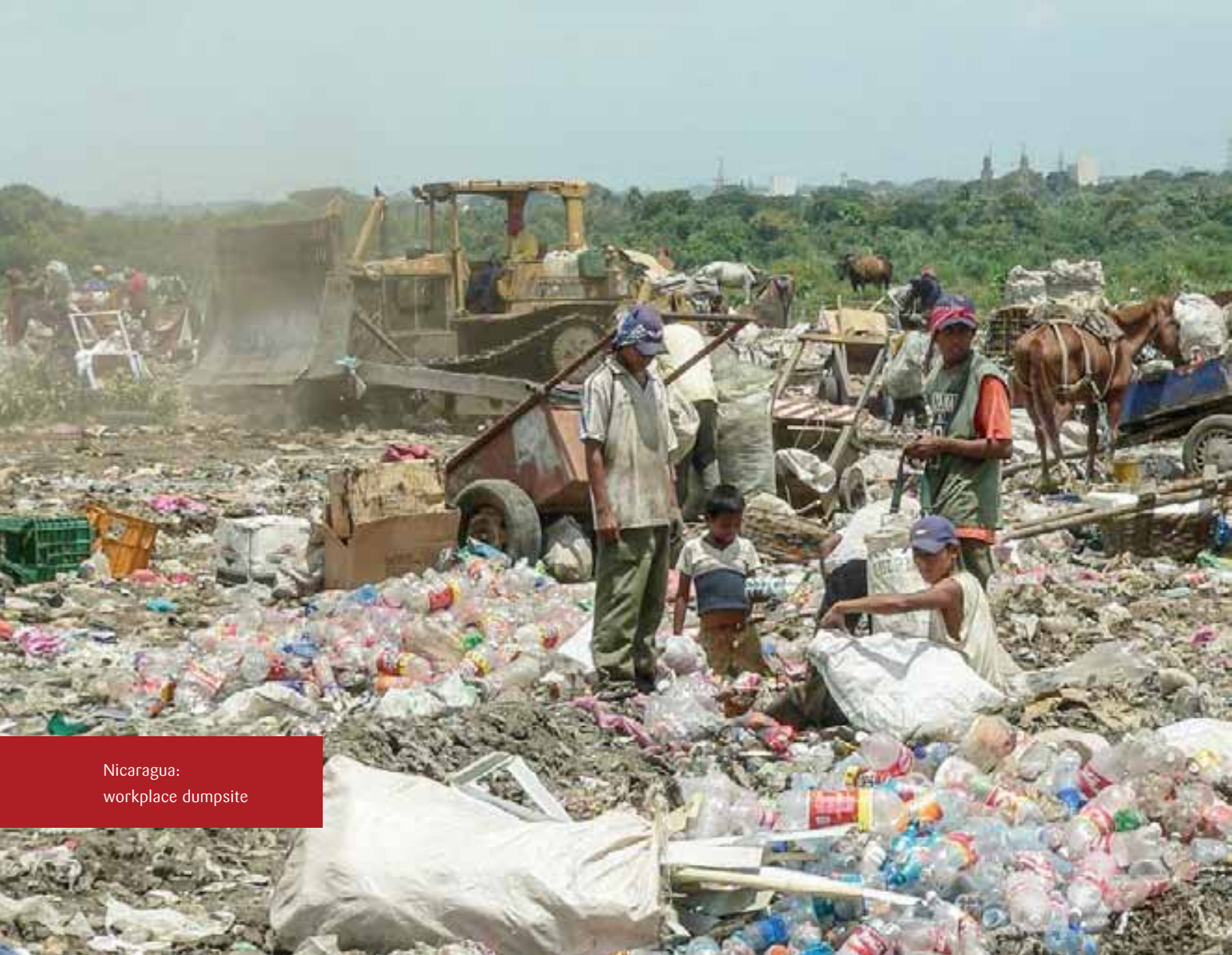
Nicaragua: workplace dumpsite

new arrivals, due to insufficient infrastructure, services, drinking water or food.