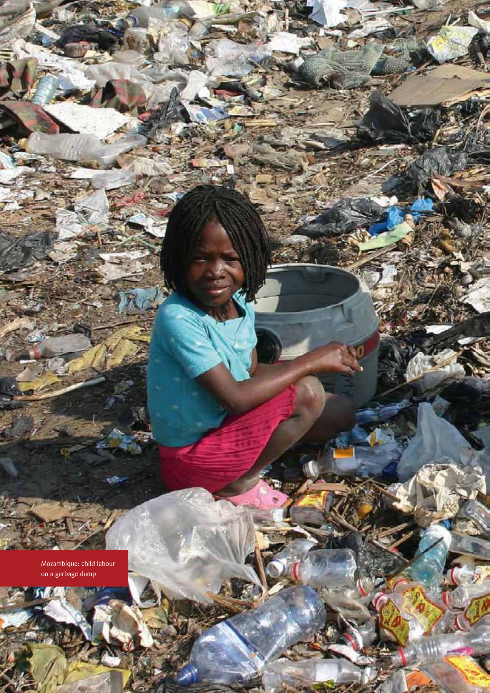
Mozambique: child labour on a garbage dump