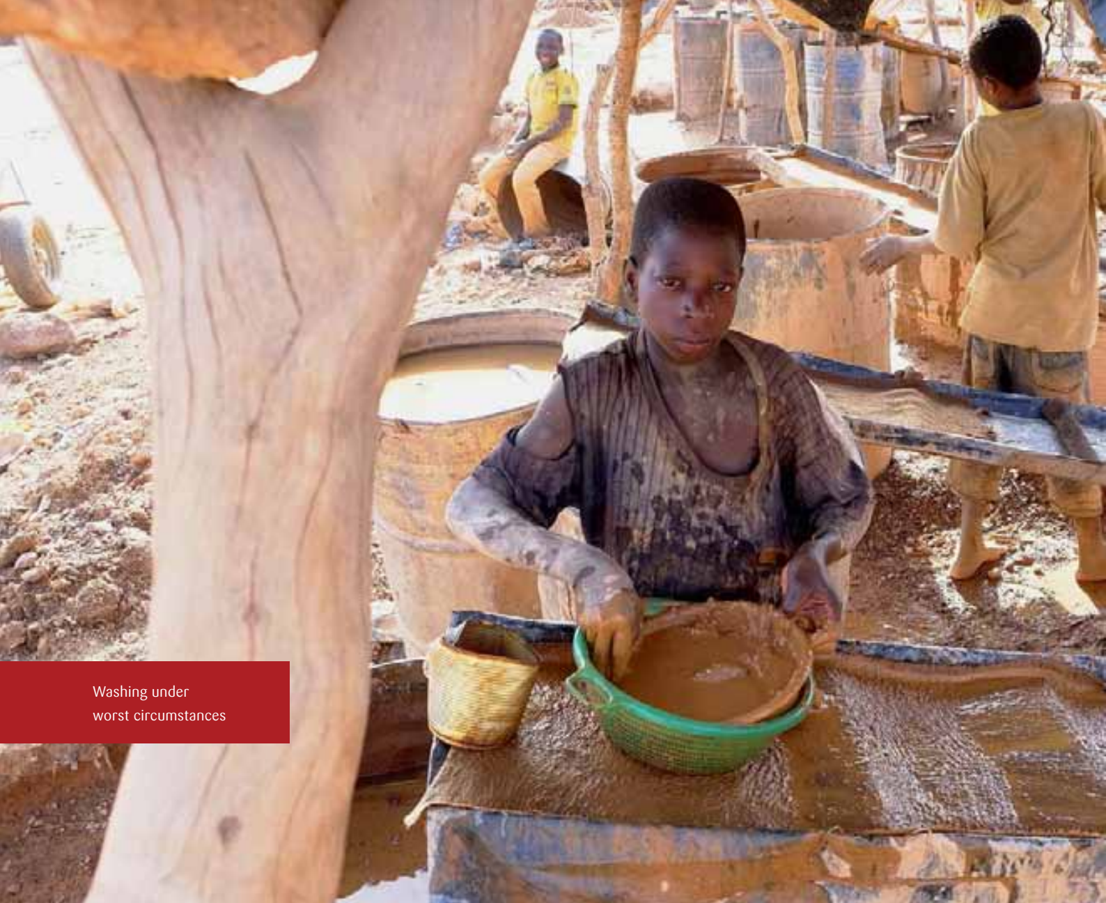
Washing under worst circumstances

record world gold prices in recent years, has led to a boom in the gold mining sector. Gold digging acts as a pull factor for child labour as it is seen as an alternative source of income and a potential way to earn money quickly. Children rush to new gold sites dreaming of a better future from the money to be made from gold. 37