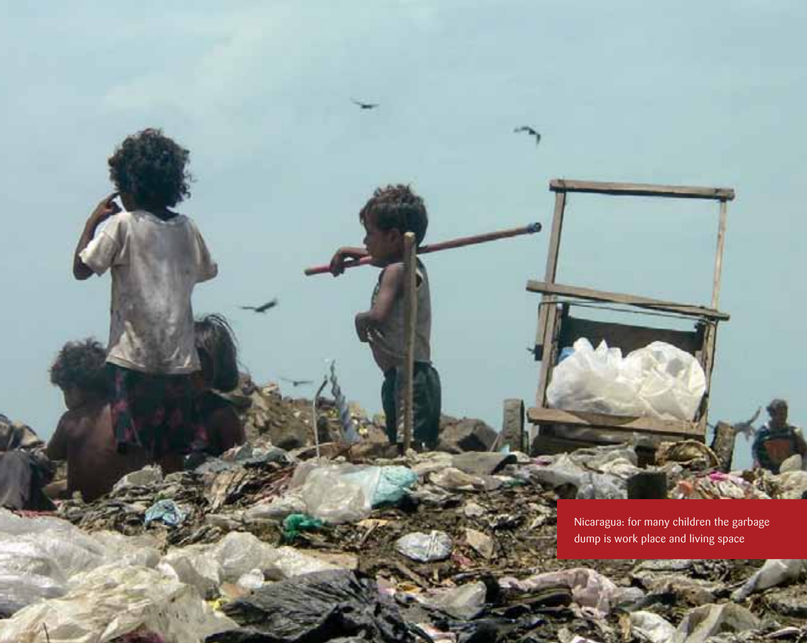
Nicaragua: for many children the garbage dump is work place and living space