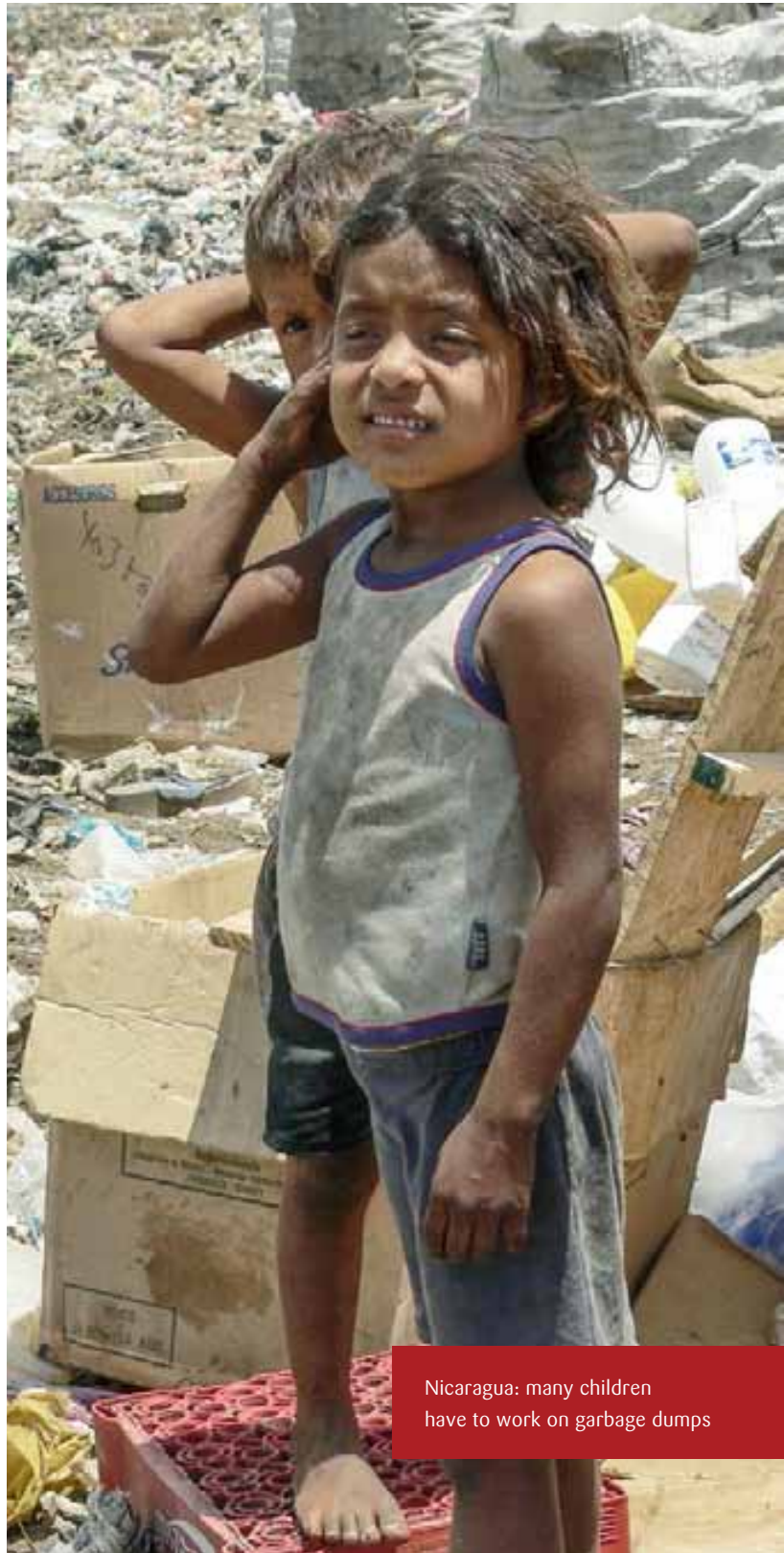
Nicaragua: many children have to work on garbage dumps

In addition, waste pickers themselves unite in cooperatives and networks to strengthen their influence on market prices, to maximize utilisation of waste, to share knowledge and build capacity and to improve their working conditions. In 2010, the network Red de Emprendedores Nicaraguenses del Reciclaje (REDNICA) has been established which has now members in departments of Matagalpa, Jinotega, Esteli, Tipitapa, Leon, Ciudad Sandino, Bluefields and Managua. The members understand themselves as part of the solution – their recycling activities contribute to a sustainable development. 110