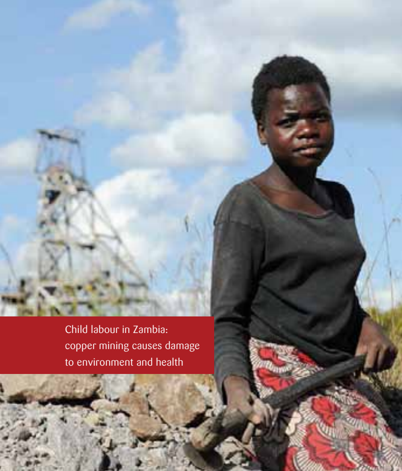
Child labour in Zambia: copper mining causes damage to environment and health