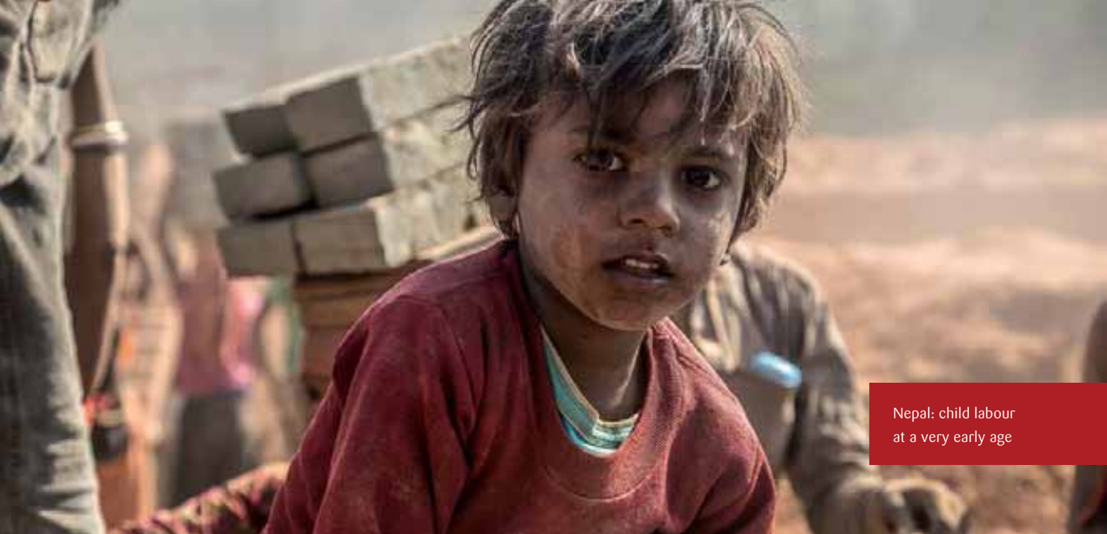
Nepal: child labour at a very early age