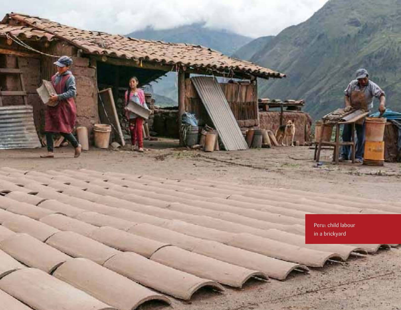
Peru: child labour in a brickyard

Terre des Hommes works to protect children in dangerous and exploitative labour conditions in Peru. This case study includes information from a project run by the Asociación Civil Inti Runakunaq Wasin in Cusco and its surrounding rural areas, which supports 350 children between the ages of 10 and 17.