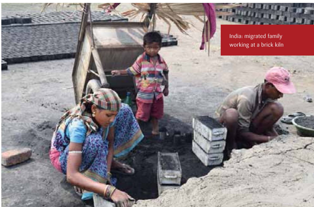
India: migrated family working at a brick kiln