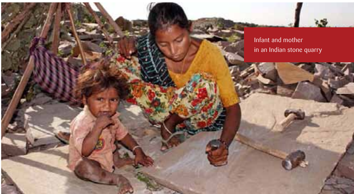
Infant and mother in an Indian stone quarry